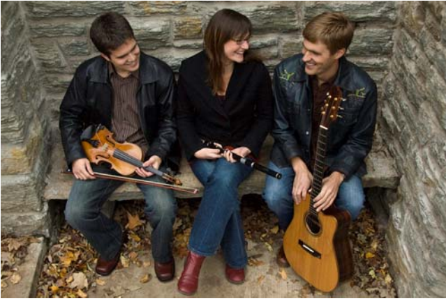
The Two Tap Trio